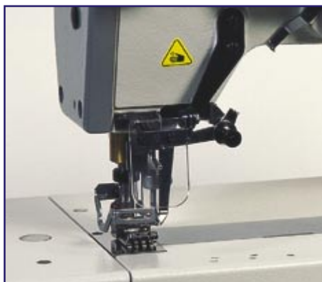
Model FB 2503-64 - Top and bottom coverstitch