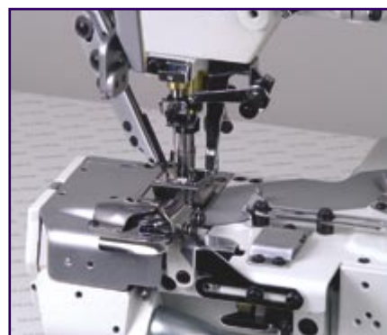
CB 2882/3 is equipped with a left hand knife