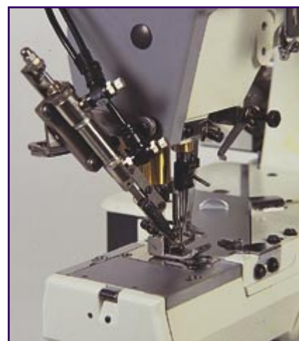
Pneumatic upper thread trimmer