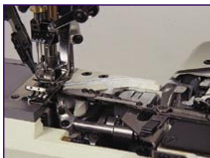
Pneumatic under thread trimmer