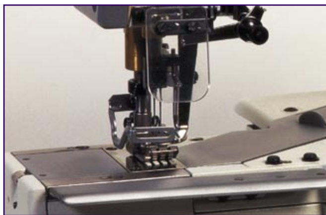
Global® model CB 2703-64 cylinder-bed model